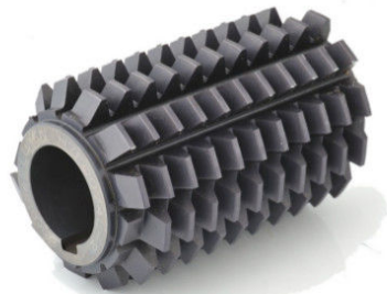
Carbide Hobs (Dry/Wet cutting)