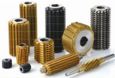
Hobs (Dry/Wet Cutting)